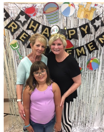
K-Kids, sponsored by the Cooley Ranch , gave their advisor a party celebrating her retirement!